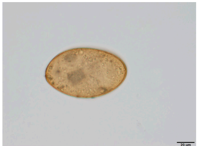
FIGURE 3. An operculate egg measuring 80 × 50 μm, brownish color, observed in the sputum.

and persistent productive cough with a rusty brown-colored sputum, and the progressive dyspnea, even when resting, produced by multiple lung lesions showed by the X-rays and CT scan. Reporting this unusual clinical presentation is beneficial for physicians and researchers working in areas endemic for paragonimiasis, as well as for clinicians examining migrant or returning tourist patients from subtropical regions as has occurred in the United States and Spain. 11 This is the first Ecuadorian case of diagnosed pleural effusion caused by P. mexicanus . Its misdiagnosis as pulmonary TB and the consequent delay in the diagnosis of paragonimiasis led to complications requiring surgical intervention. Even though Ecuador is the most endemic country in the Americas, clinicians are unfamiliar with the disease. 2 In addition, laboratory technicians are not well trained for recognizing eggs of Paragonimus . This may be due to the fact that the number of clinical cases is declining and that